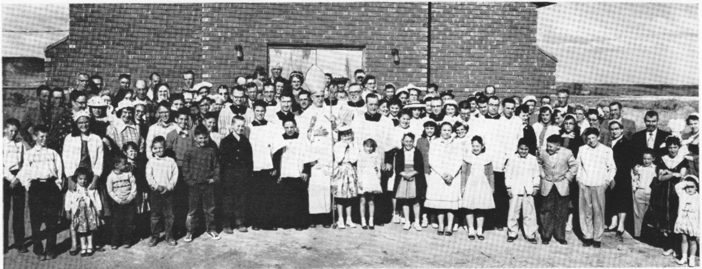
The crowd that gathered to celebrate the dedication of the new Holy Family Church erected in memory of the families of the Archdiocese of Boston at Arock, Oregon, on May 3, 1959.